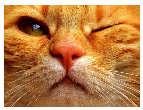
It's Not Just for Winking!

If you're teaching writing this fall, check out the new <u>resources</u> on The MLA Style Center ! We've added lesson plans and worksheets to teach students when they need commas and to help them master independent clauses and modifying phrases. Stay tuned for more exercises soon!