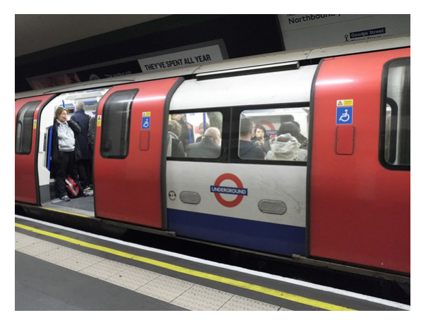
Mind the Gap